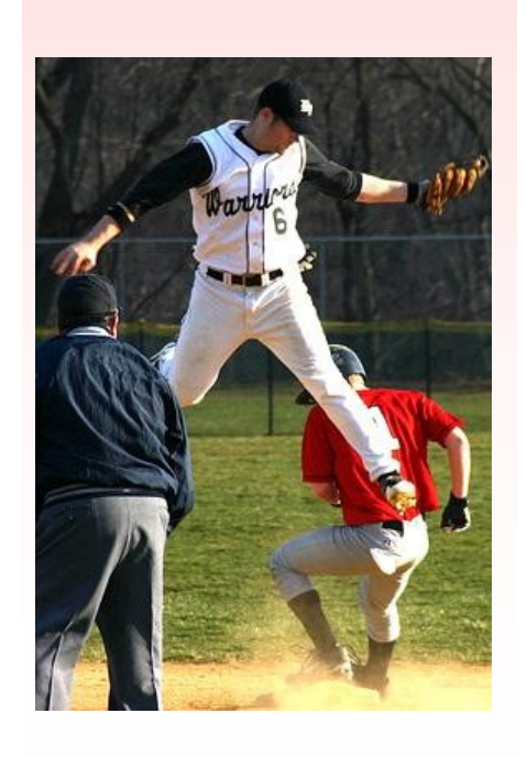
Hustling is an Attitude

Make checks payable to "Warrior Baseball"